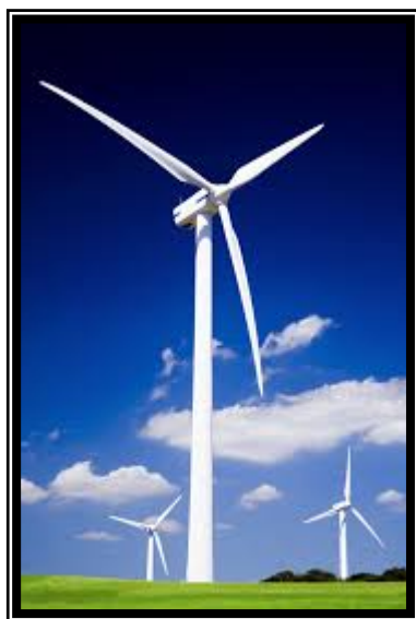
Turbines similar to what will be installed. Not an exact rendering.

In October, the City Council adopted The Gonzales Economic Development Strategy and Action Plan , which outlines a vision and action plan to achieve the City's economic goals over the next five years. Preparation of the Strategy and Action Plan was guided by the City's Economic Development Committee and includes input from more than 50 community members, youth and business leaders.