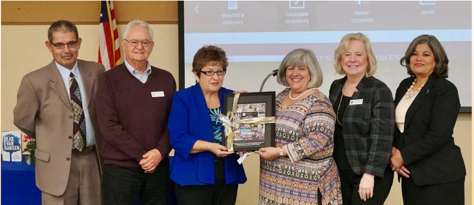
In 2018, the City of Gonzales was awarded the first-ever Champion for Children Award from the Monterey County Children's Council