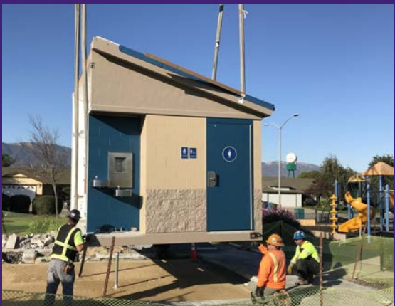
In October 2018 the public restroom at Meyer Park was replaced with a modern restroom