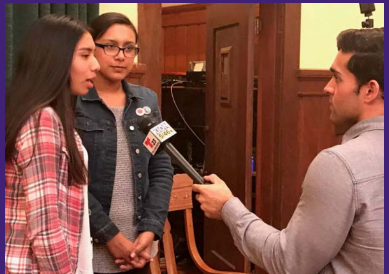
Photo: A local reporter interviews members of the Gonzales Youth Council about the passage of a social host ordinance. (June 1, 2018, Western City article by Hang Tran)

Read about Gonzales youth civic engagement and how cities like ours are working hard to create the next generation of informed and engaged citizens.