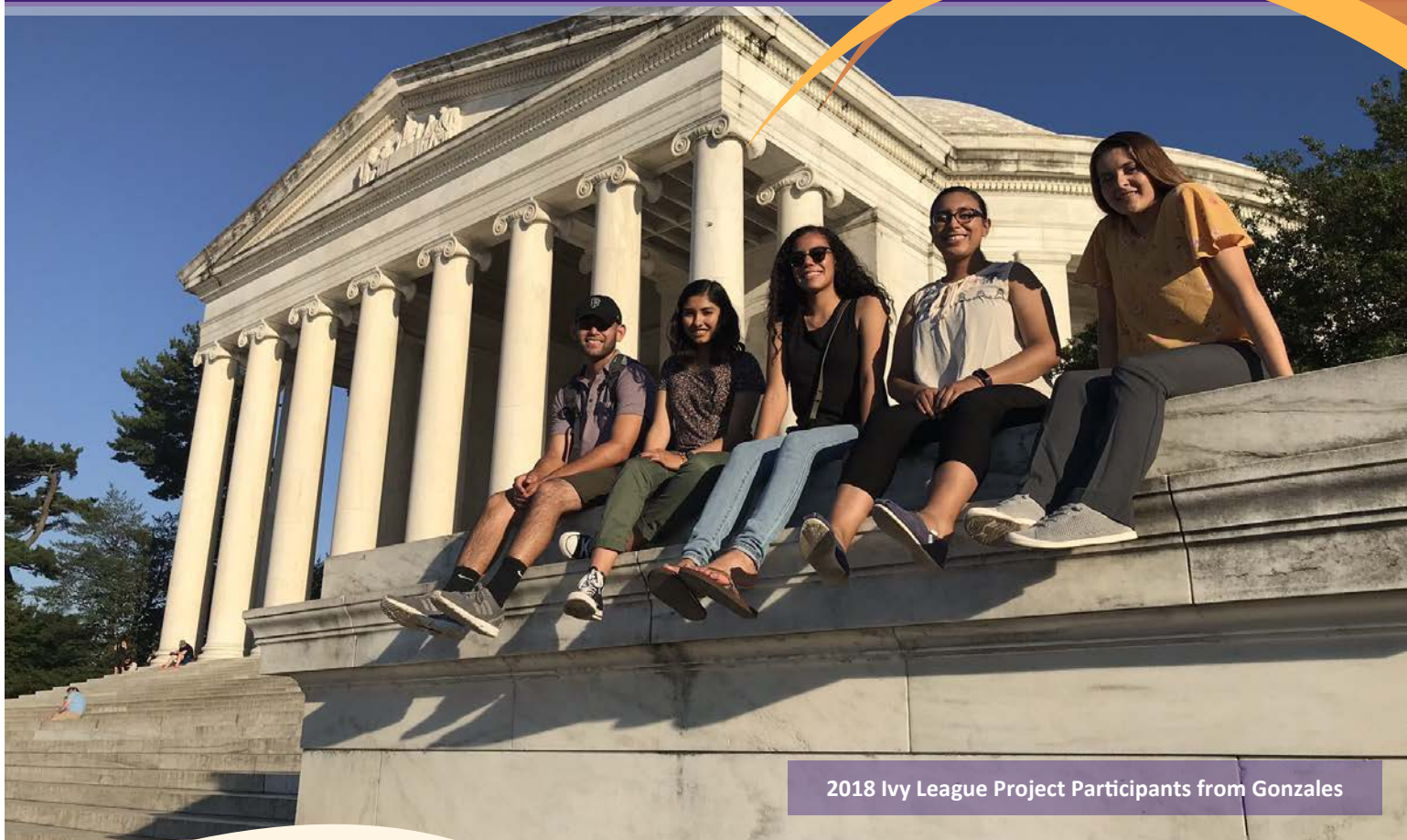
2018 Ivy League Project Participants from Gonzales